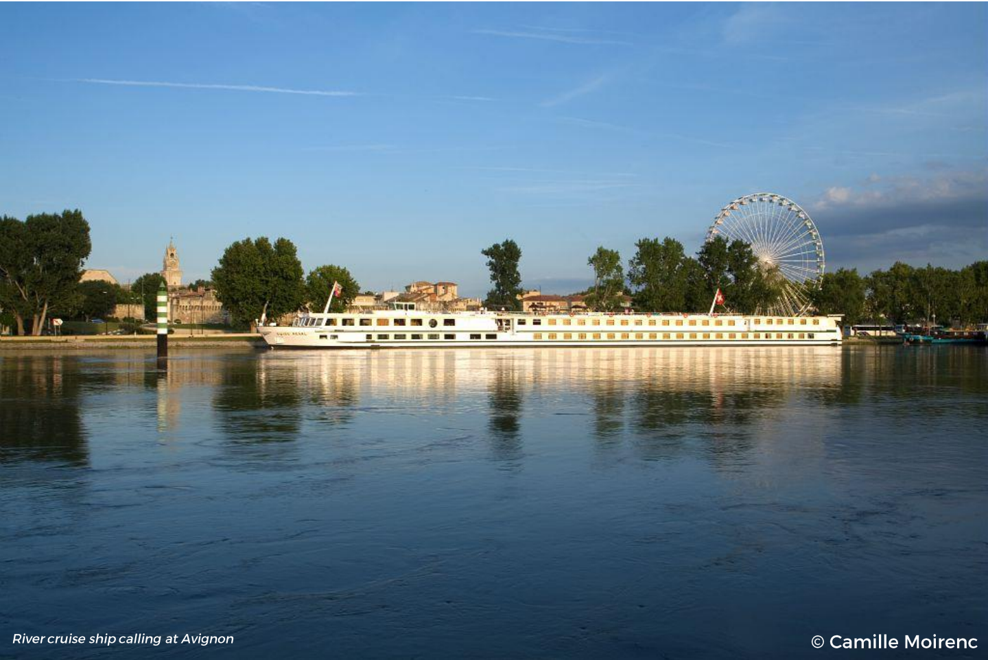
River cruise ship calling at Avignon